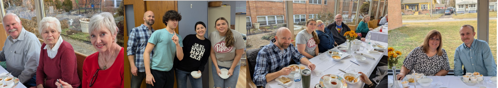
Souper Bowl Sunday Soup/Chili Cook Off!