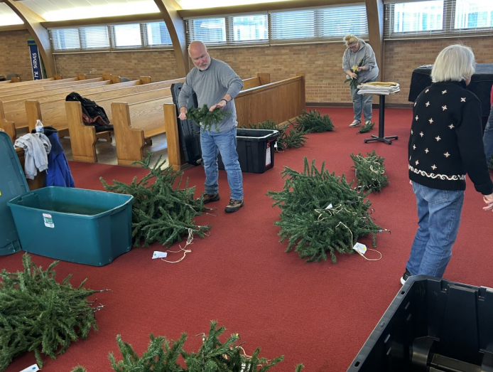
Packing up Christmas decorations