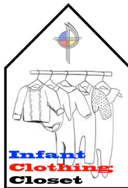
New ICC logo and sign