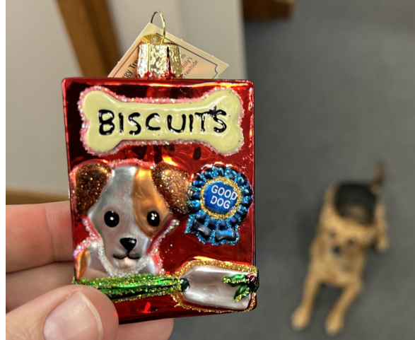
Biscuit's Good Boy Treat