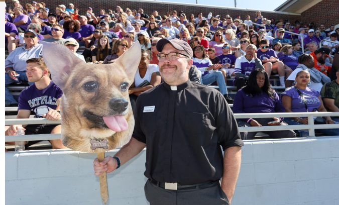
November Photo Dump!