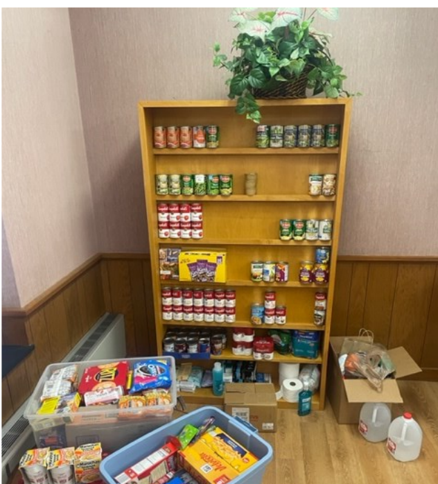
Little Free Pantry items collected from our food drive!