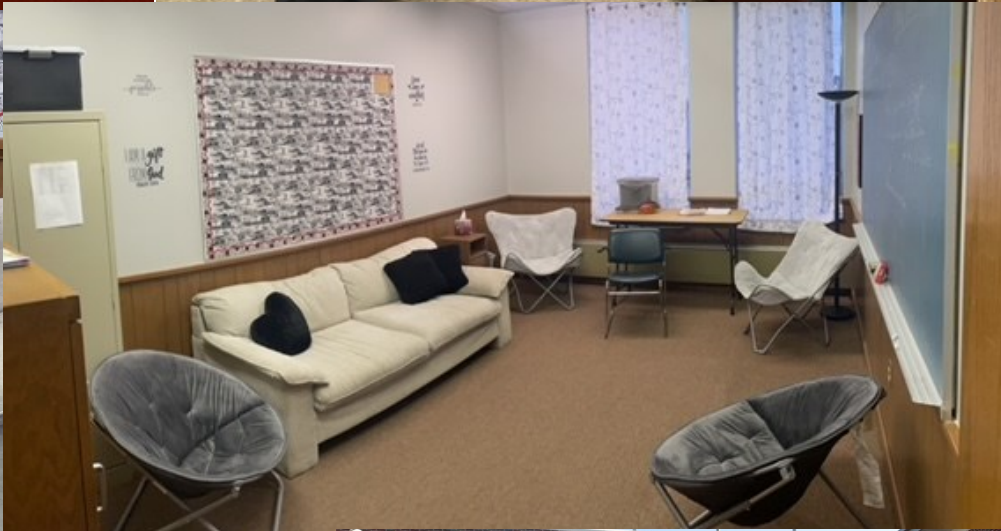
Sunday School Kids enjoying the new Youth Room!