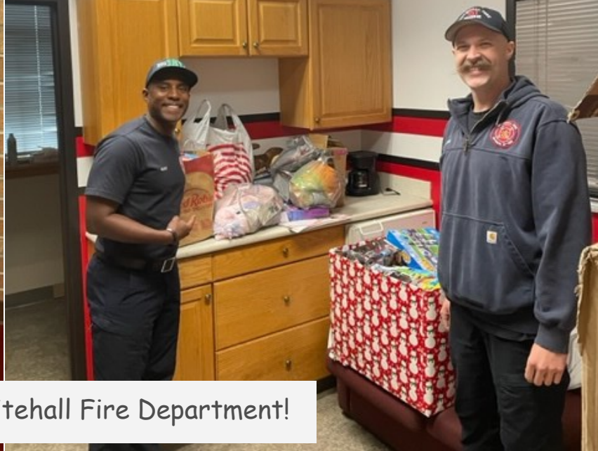
Toy Drive with Whitehall Fire Department!