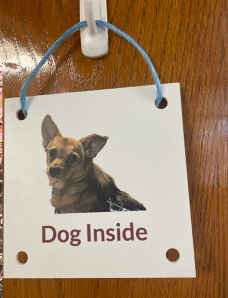
New office decor