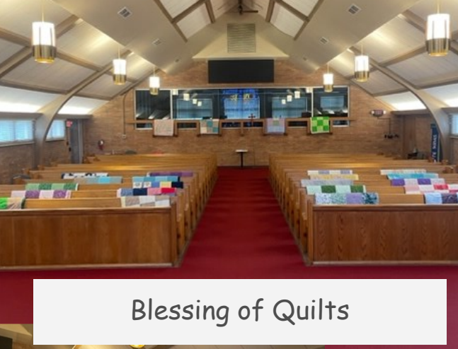
Blessing of Quilts