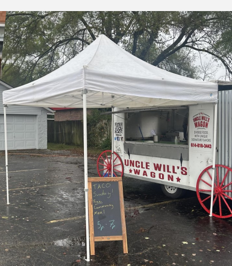
Rainy Taco Sunday