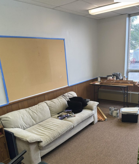
Future Youth Room