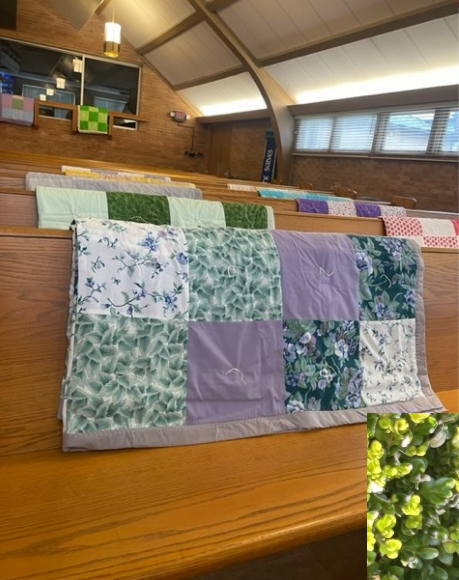
September Photo Dump!