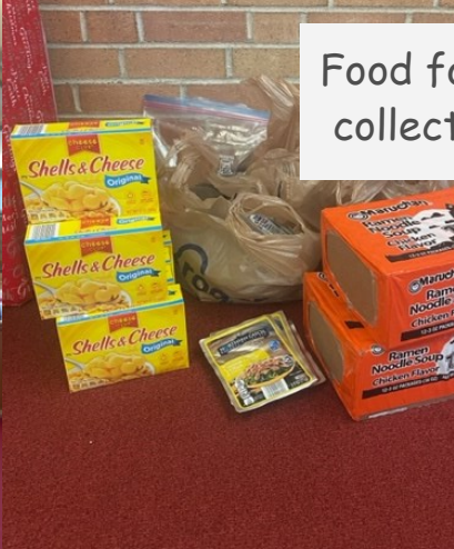
Food for the Free Little Pantry collected from our food drive!