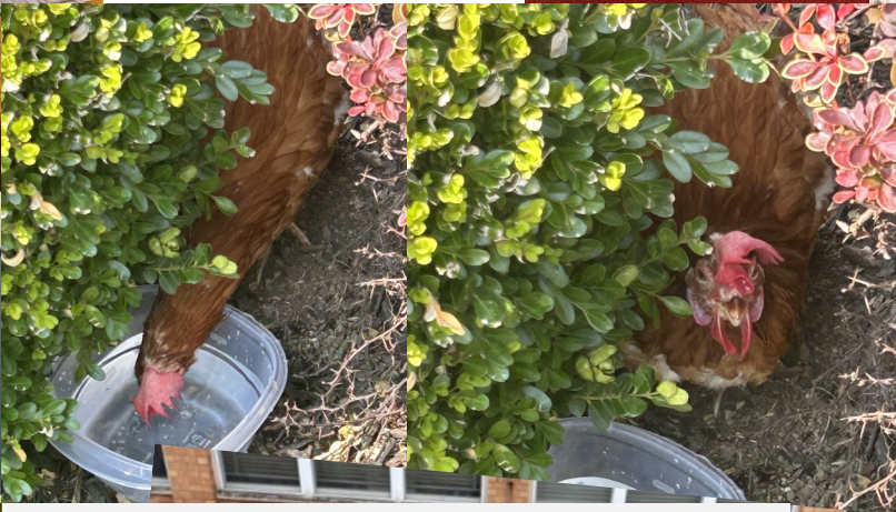
Chicken running around Collingwood Ave