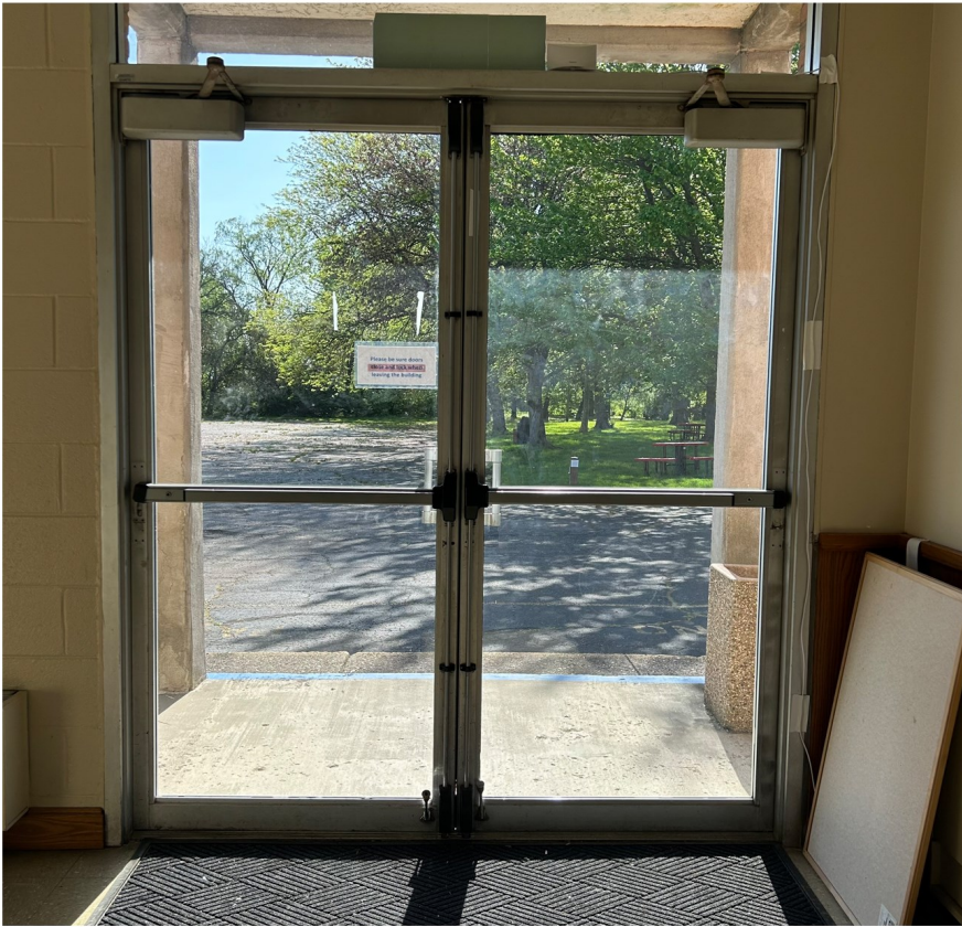
Elm St. glass door has been replaced.