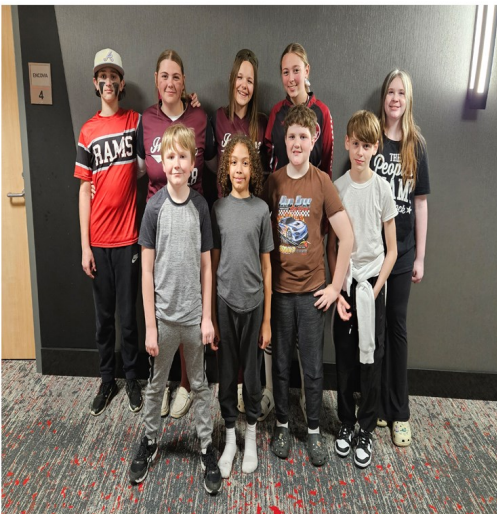
FAITH Youth @WWE Raw!